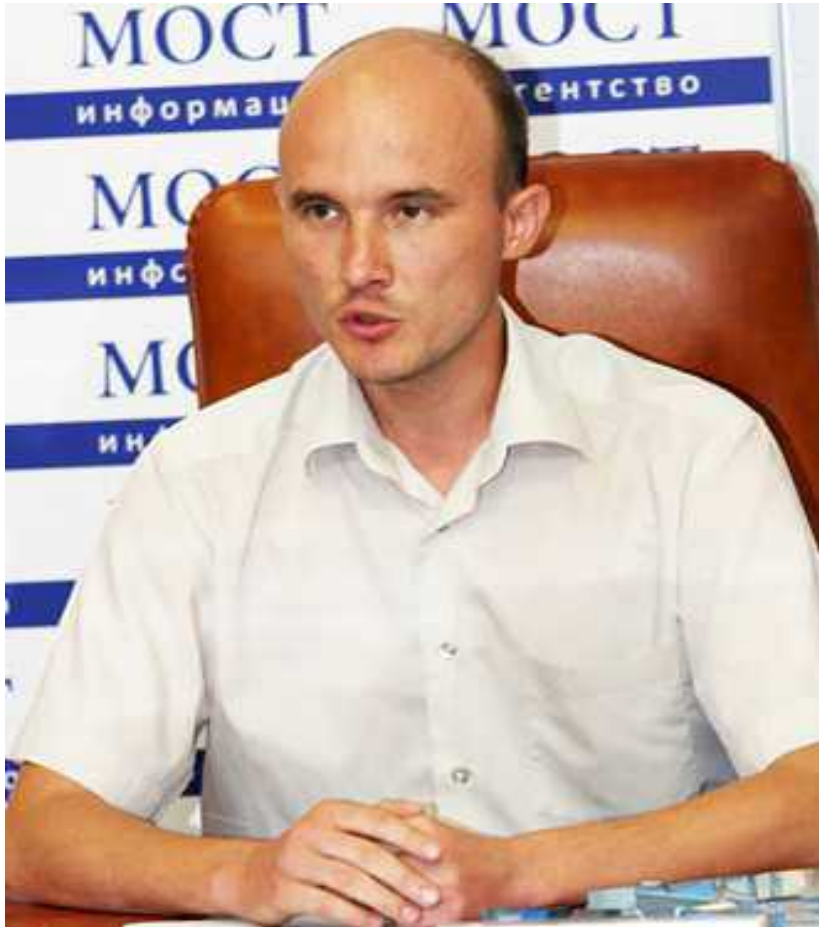
First Secretary of the Dneprodzerzhinsk Municipal Committee of Communist Party of Ukraine , city council member