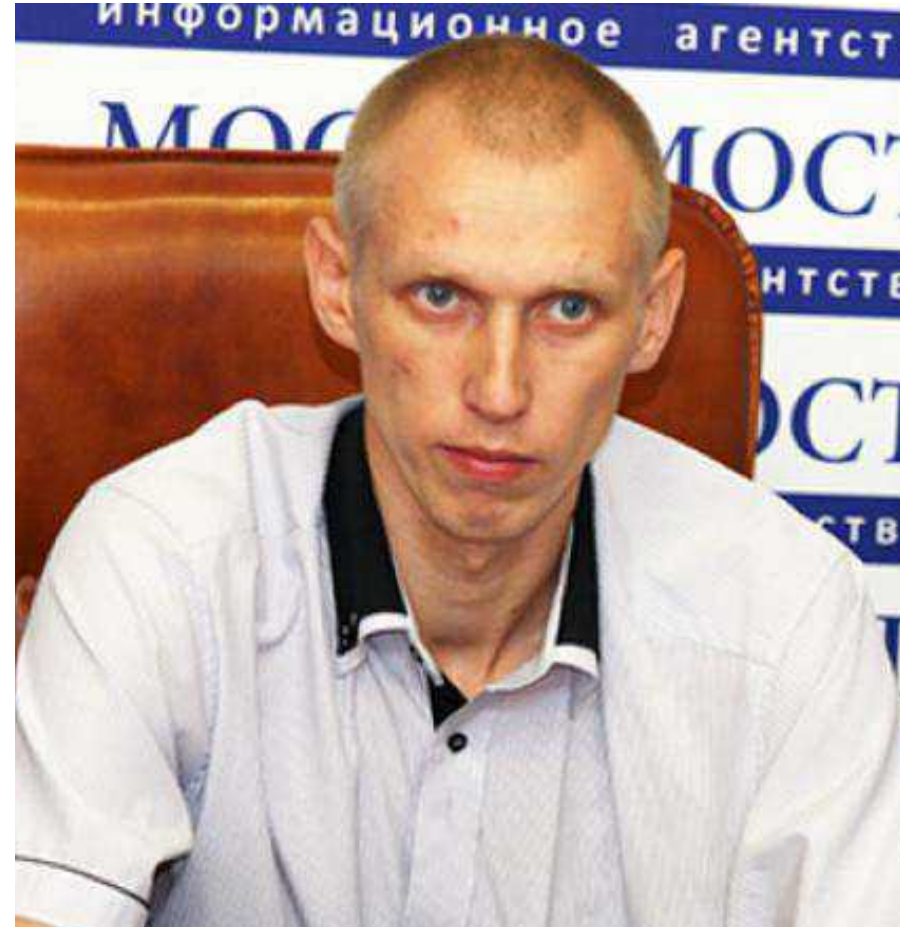
Second Secretary of the Bagleyskiy District Committee of Communist Party of Ukraine, district council deputy