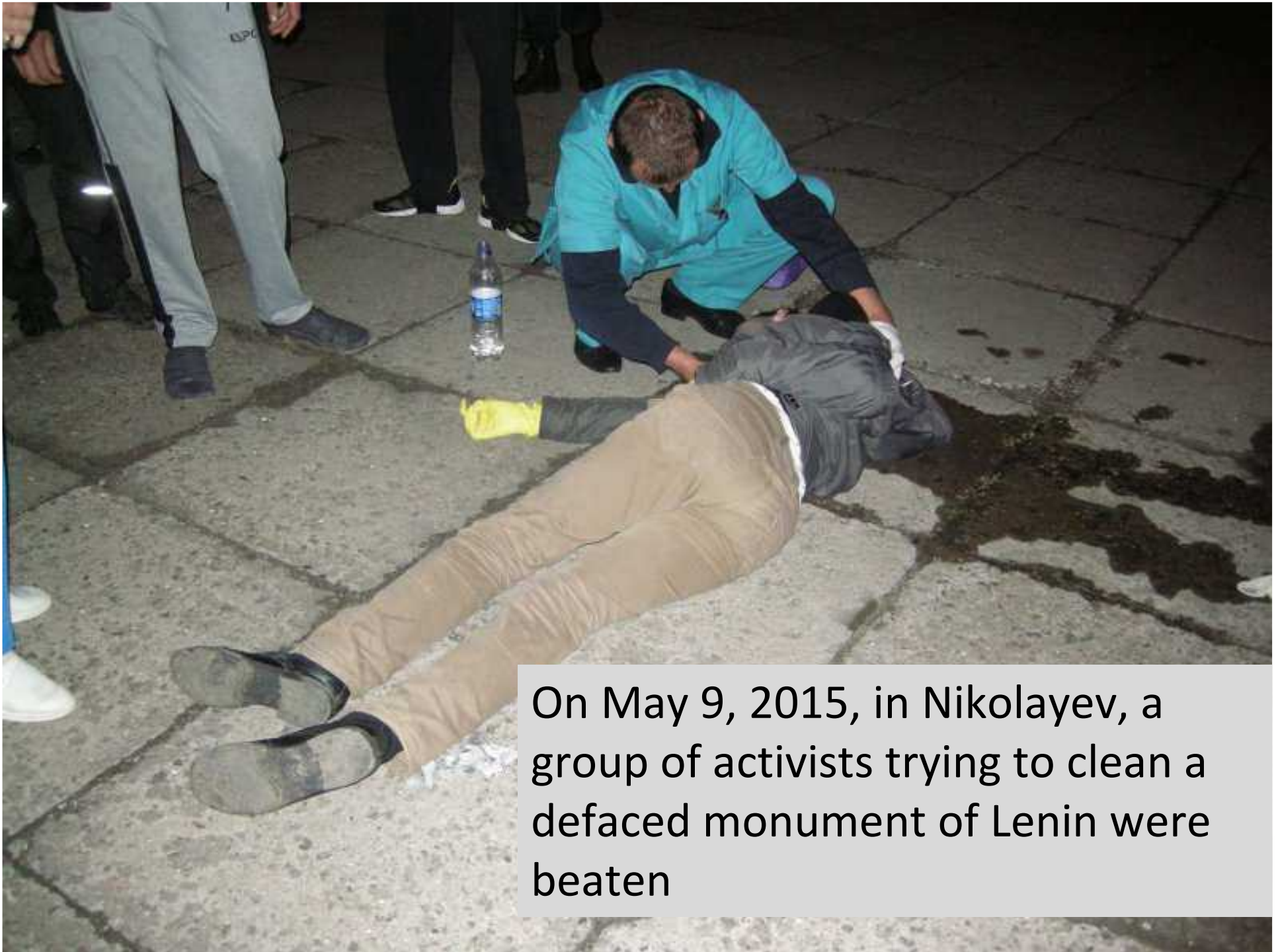
On May 9, 2015, in Nikolayev, a group of activists trying to clean a defaced monument of Lenin were beaten